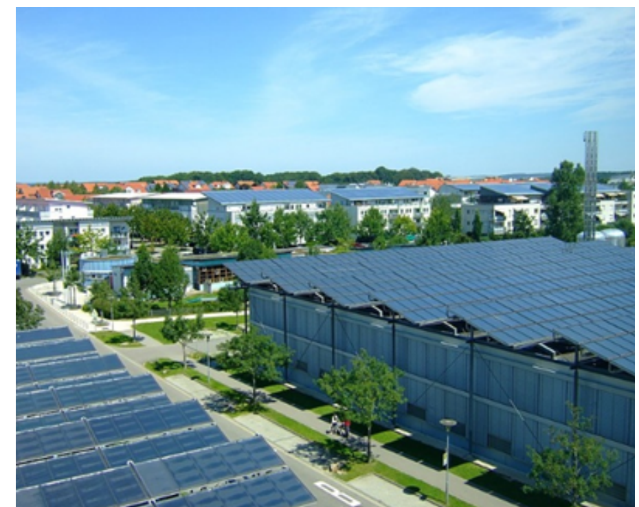
Solar panels on roofs in the German town of Amorbach (2006)