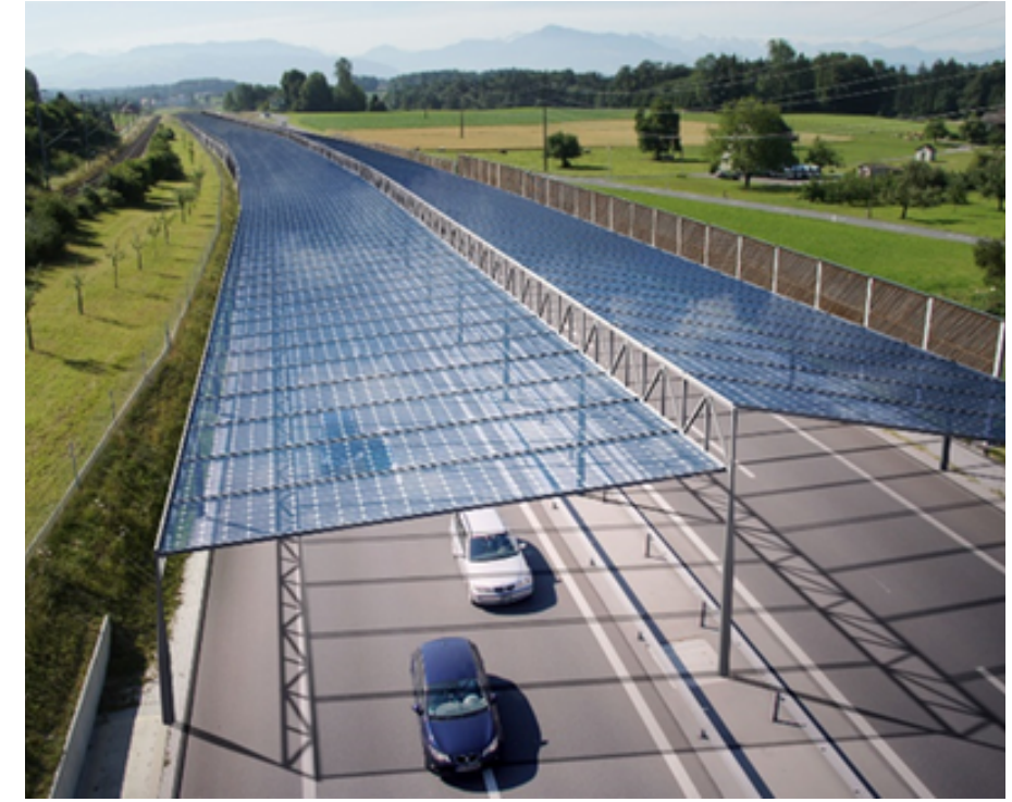
Solar Panels on Highways, Germany

The consultation is now closed. Thank you to all our supporters for sending a resounding message to the government to protect and preserve our countryside and our literary heritage for future generations.