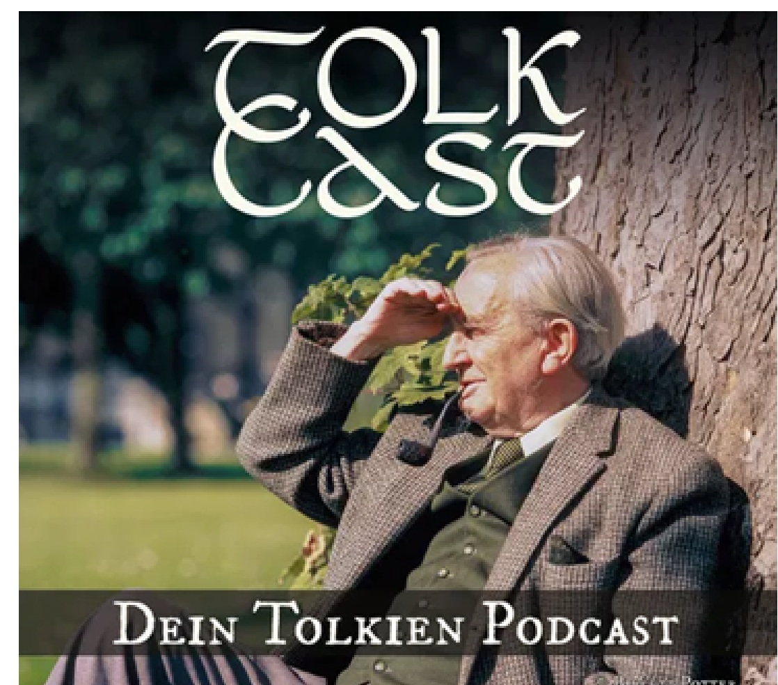
Cover photo of TolkcCast