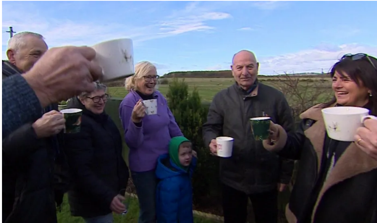
Campaigners celebrate High Court victory