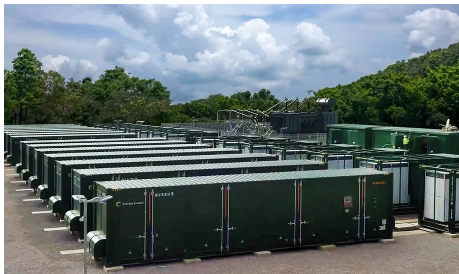
Stratera battery storage facility

The Planning Inspector has dismissed a developer's appeal upholding the Council's refusal of a planning application for the installation of a battery energy storage system in East Devon. This is similar to the one planned for Inkberrow.