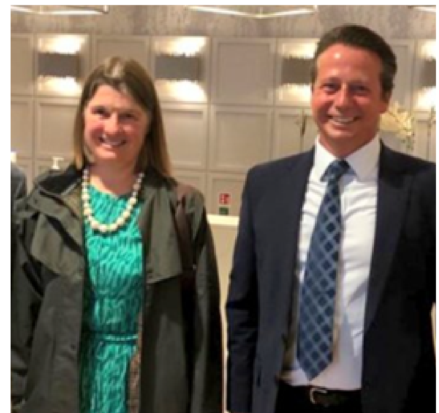
Rachel Maclean MP and Nigel Huddleston MP