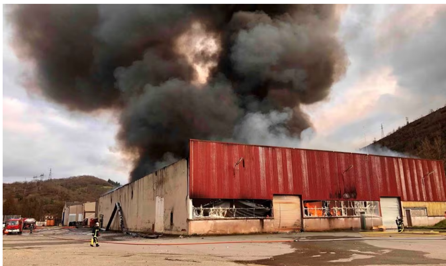
Fire at storage facility in southern France