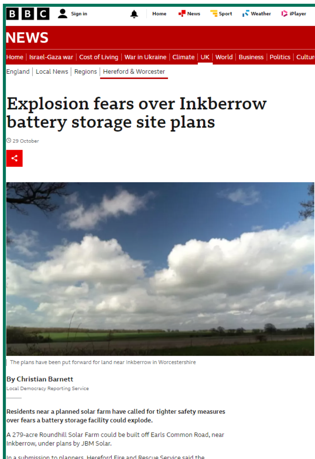
BBC News 29th October 2023