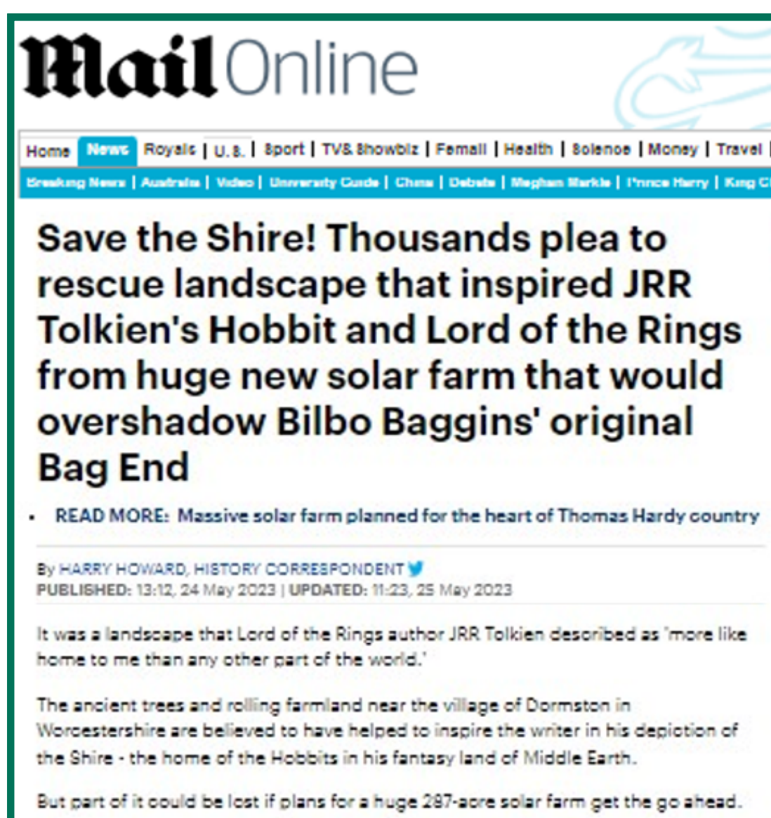
The Daily Mail 25th May 2023

Our campaign to Save the Shire has been featured in The Daily Mail and BBC News .